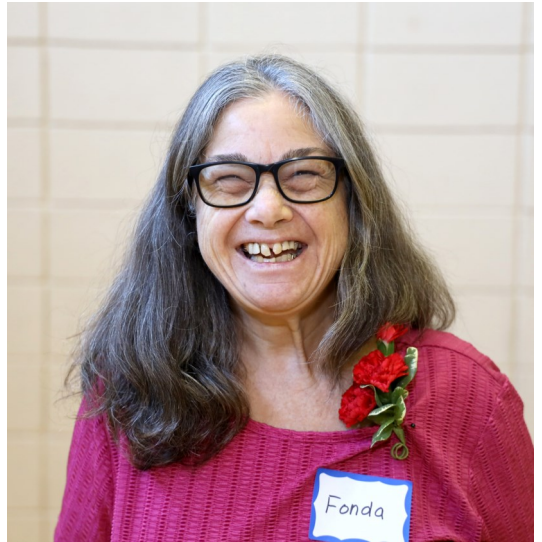
Fonda Castle Greenville, SC