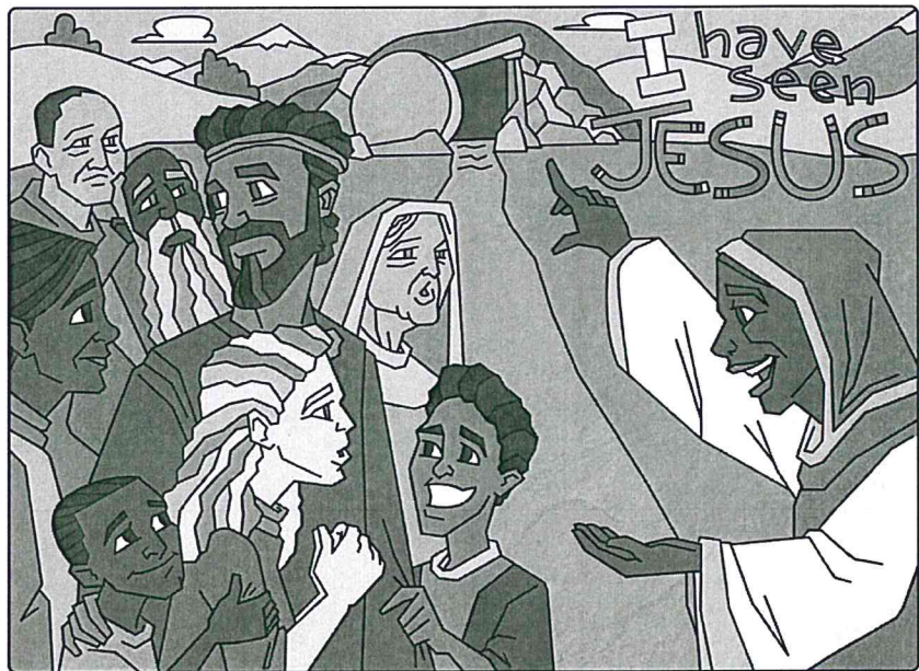
John 20:1-18 - illustratedministry.com

When Jesus speaks her name – "Mary!" – everything she thought she knew is both undone and reaffirmed. The powers that killed Jesus had not won, after all. The violence that seemed triumphant turned out not to be the stronger force. Her hopelessness in the wake of this loss began to disappear. She is recognized. She is known. She is commissioned to share the Good News that life and love have the last word.