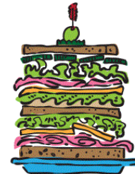
Lunch for LCY

Current middle and high school youth will have several opportunities over the summer to catch up with church friends. The group will meet at the Red Canopy Door at noon and walk downtown for lunch. Pick up will be at 2:00 pm at the Church. Youth should bring about $15.00 for their lunches. Dates are Wednesday, June 13, Wednesday, July 25 (VBS week), and Wednesday, August 8.