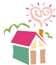
Food and Shelter

Food items are needed to pack lunches and provide snacks for GAIHN guests during host week. A display containing a list of needed items as well as a sign up sheet will be located in the Parlor beginning on Sunday, August 28. The items should be returned to the Kitchen in the Activities Building no later than 11:00 am on Sunday, September 18.