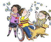
Just for Kids!

Mark your calendars for the Kids' Stuff and Club 345 kickoff event, which will be held on Sunday, September 11 at Heritage Park in Simpsonville from 1:00 to 3:00 pm. This event is for families in K5-5th grade. Families are encouraged to bring a picnic lunch. The groups will then enjoy fun, games and music.