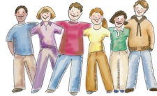
Lutheran Church Youth

Youth will travel by bus for dinner and games at Frankie's Fun Park . Youth should bring money for games as well as money for dinner at Johnny Rocket's . Youth who are confirmed on the morning of March 29 will have their dinner paid for and receive a $10.00 game card.