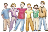
Lutheran Church Youth

MARK YOUR CALENDARS - LCY’s annual fall retreat will be Saturday, August 27 through Sunday, August 28 at Lutheridge. An email with further information will be sent to families later this month.